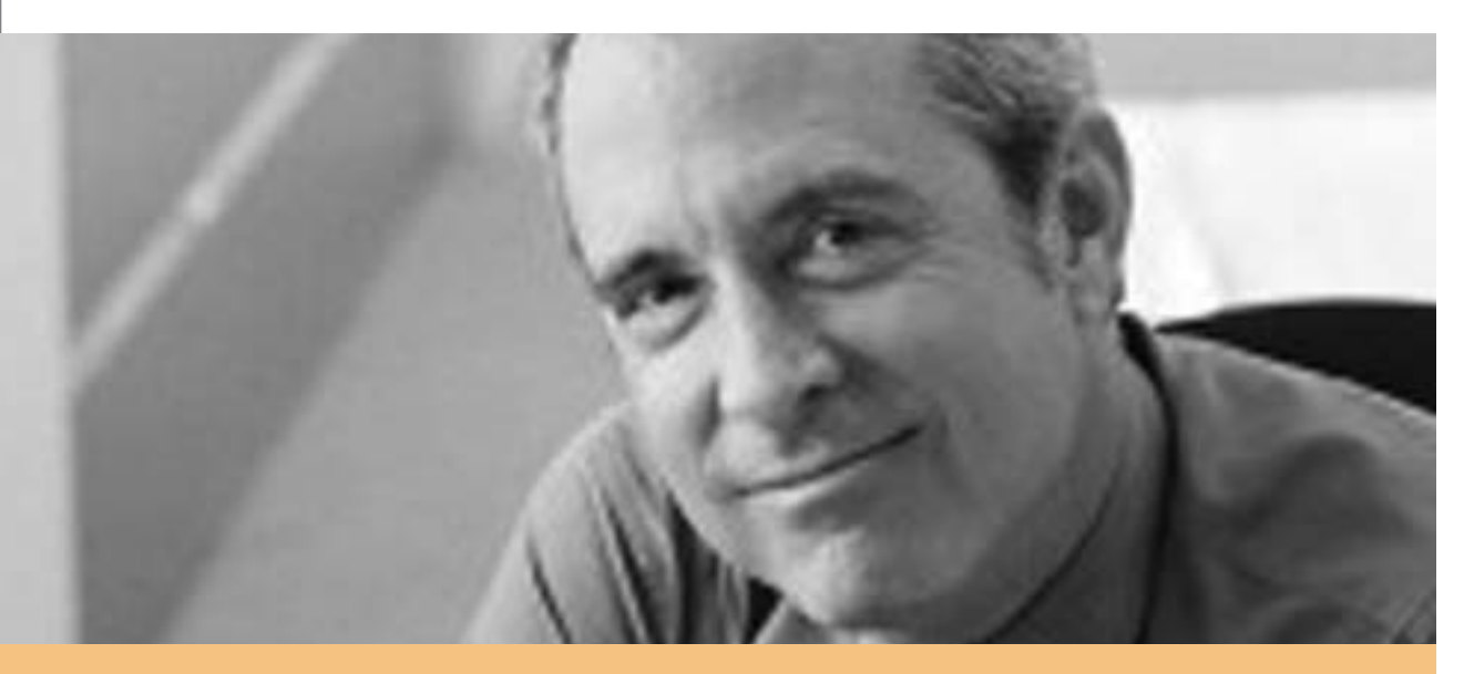
The MasterCard Payment Gateway™— the advanced way to pay and increase profits.