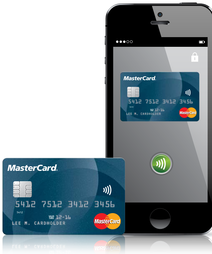
3 CVC: Card Verification Code.