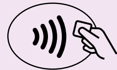
Contactless Symbol (Reader)